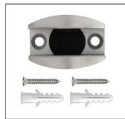
SS-GGD Glass Door Guide