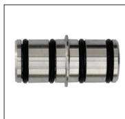
SS-RR-C Round Rail Connector