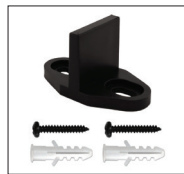
SS-GWD Wood Door Guide