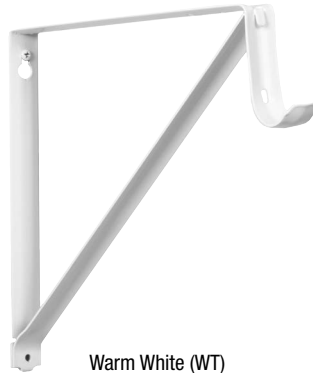
Warm White (WT)