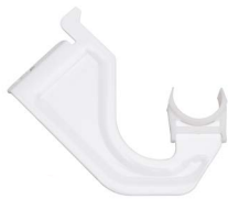
1188 Closet Rod Hook