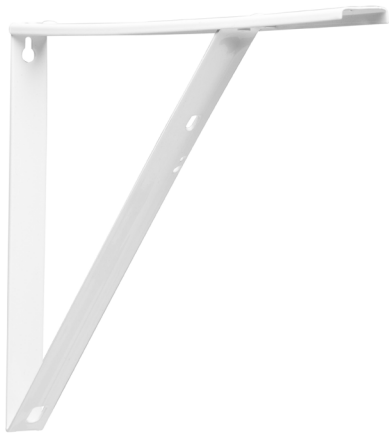
1188 Heavy-Duty Shelf Bracket