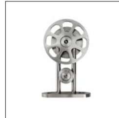
SS-TMSW-65 Spoke Wheel