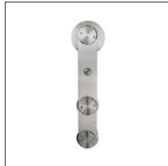
SS-FMSS-65 Strap Stick

*Carriers shown to represent kit style, not sold separately