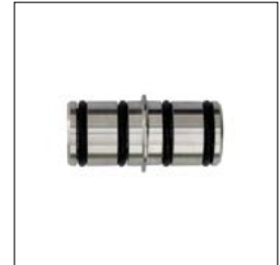
SS-RR-C Round Rail Connector