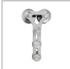
SS-FMDW-65 Strap Dual Wheel