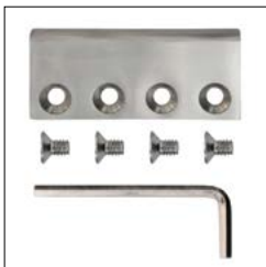
SS-FR-C Flat Rail Connector