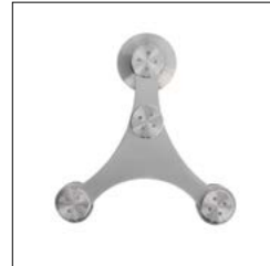
SS-FMST-65 Strap Triangle