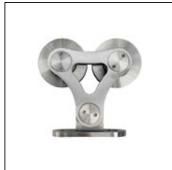
SS-TMDW-65 Dual Wheel