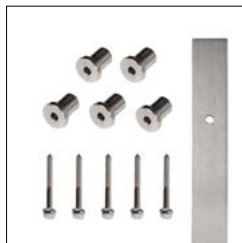
SS-FR-65 (pack of 5 pcs) SS-FR-65-A (pack of 1 pc)