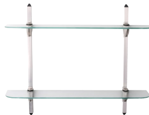
0132-524-GL2 Adjustable Glass Shelf Kit • 18" x 23.63" x 5.63" • Holds 50 lbs.

Shelf-Made™ Glass Shelf Kits are a decorator's choice, providing a wide range of options for any project. With a variety of contemporary and classic styles, there is something for everyone. All components and kits contain easy to read instructions and all the necessary hardware. Each style combines competitive pricing with quality product to drive market demand.