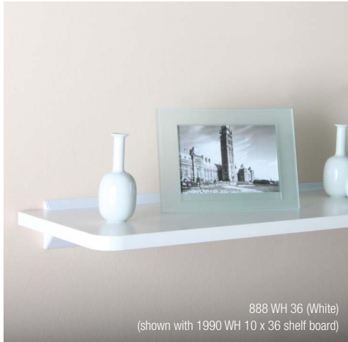
888 WH 36 (White) (shown with 1990 WH 10 x 36 shelf board)