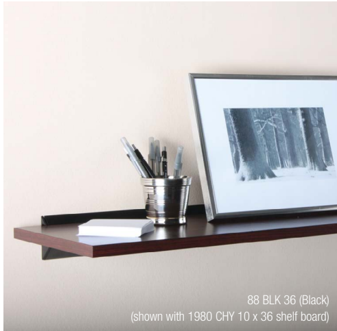
88 BLK 36 (Black) (shown with 1980 CHY 10 x 36 shelf board)