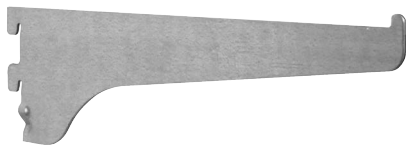
170E Series Bracket