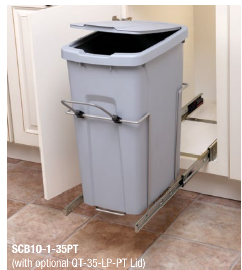
SCB10-1-35PT (with optional QT-35-LP-PT Lid)