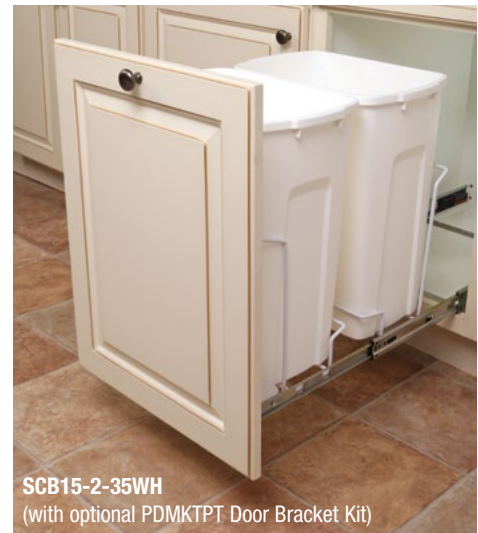
SCB15-2-35WH (with optional PDMKTPT Door Bracket Kit)