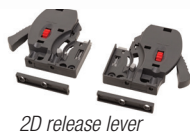
2D release lever