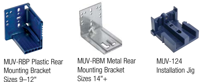
MUV-RBP Plastic Rear Mounting Bracket Sizes 9–12"