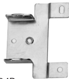
4104B Front Face Frame Bracket