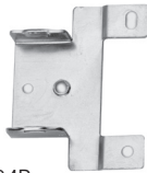
4104B Front Face Frame Bracket